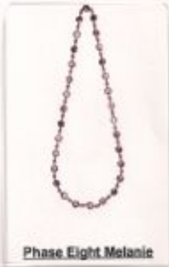
Phase Eight Melanie