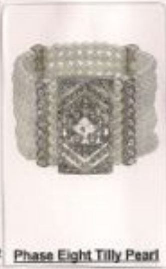
Phase Eight Tilly Pearl