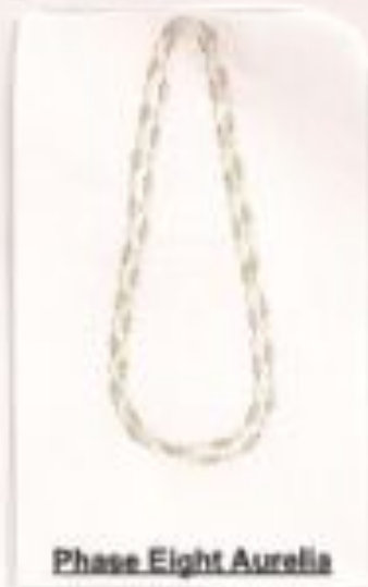
Phase Eight Aurelia