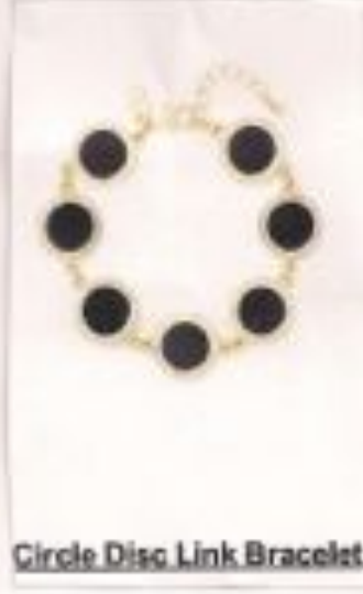
Circle Disc Link Bracelet