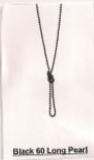
Black 60 Long Pearl