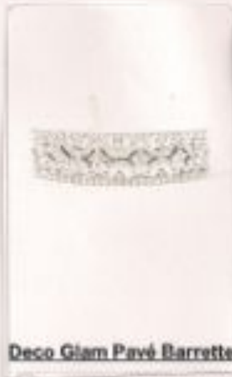
Deco Glam Pavé Barrette