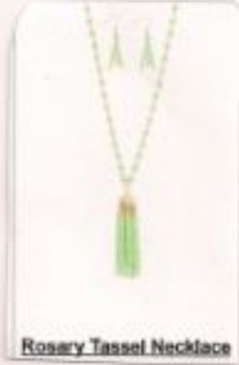
Rosary Tassel Necklace